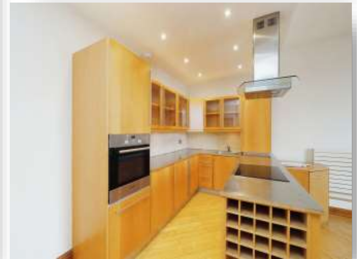
Phoenix House Berridge Street,Leicester LE1 5JE