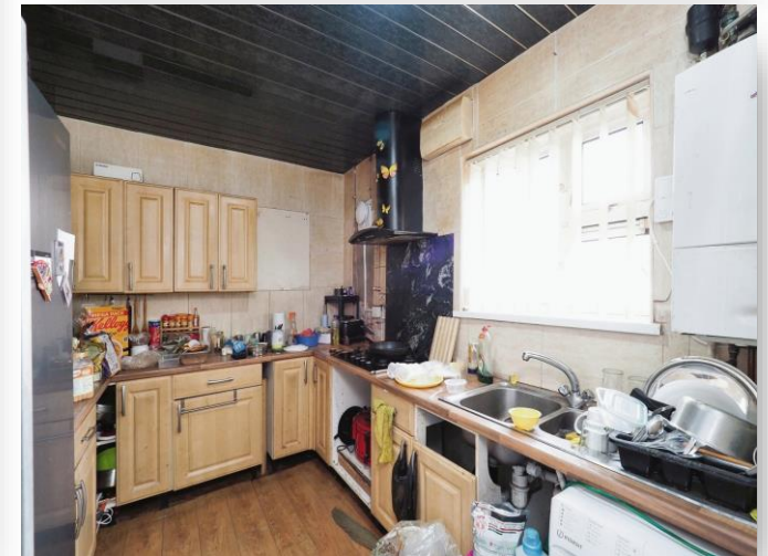
Gipsy Lane, Leicester LE4 6RF