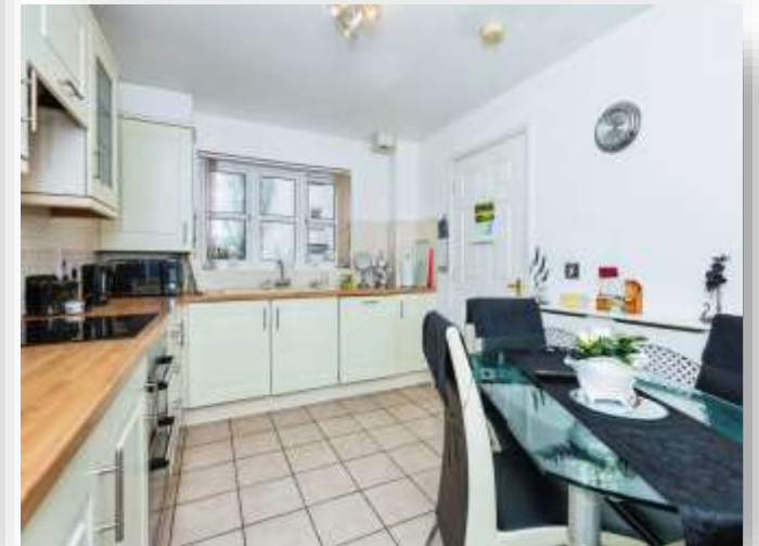
Hallam Fields Road, Birstall Leicester LE4 3LH