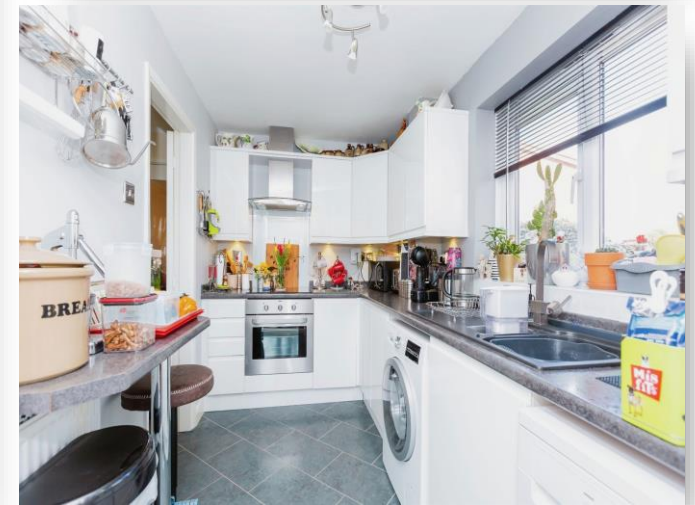
Willow Walk, Syston Leicester LE7 1GF