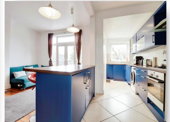
Avon Road, Leicester LE3 3AA