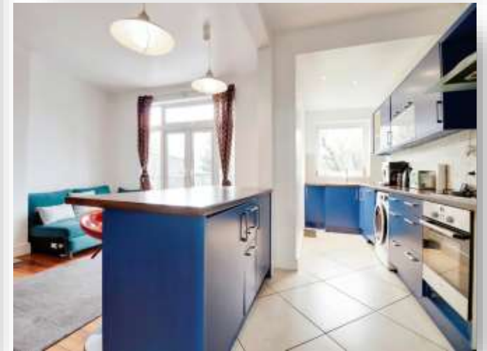
Avon Road, Leicester LE3 3AA