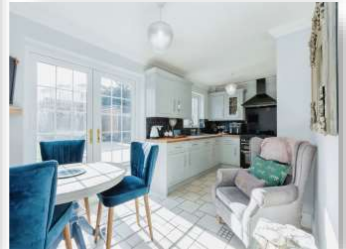
Fern Close, Thurnby Leicester LE7 9QJ