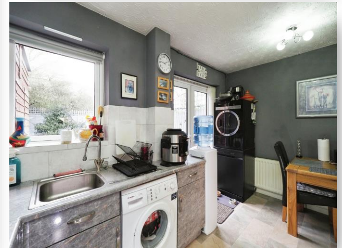
Pinehurst Close, Leicester LE3 6UY