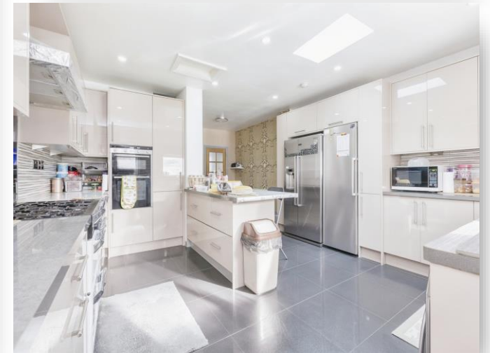
Hollington Road, Leicester LE5 5HT