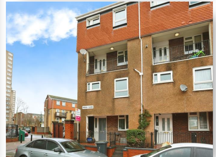
Mensa Close, Leicester LE2 0UT