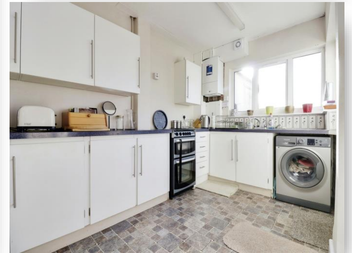
Clarke Street, Leicester LE4 7QP