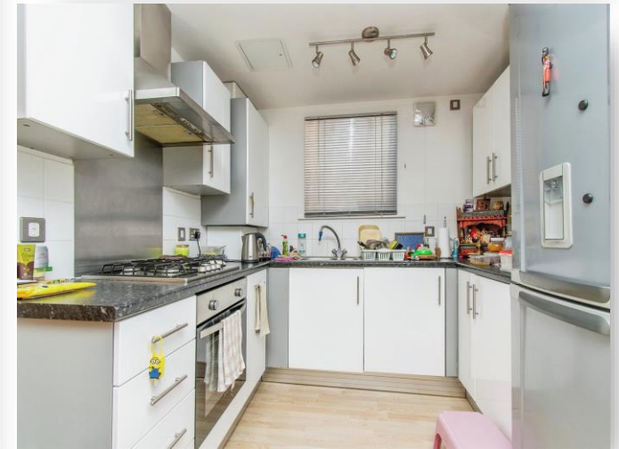
Sandhills Avenue, Hamilton Leicester LE5 1PL