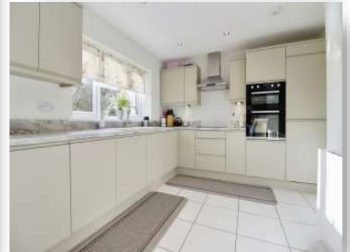
Leicester Lane, Desford Leicester LE9 9JJ