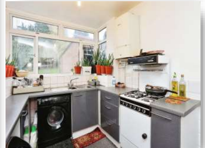
Headland Road, Leicester LE5 6AE