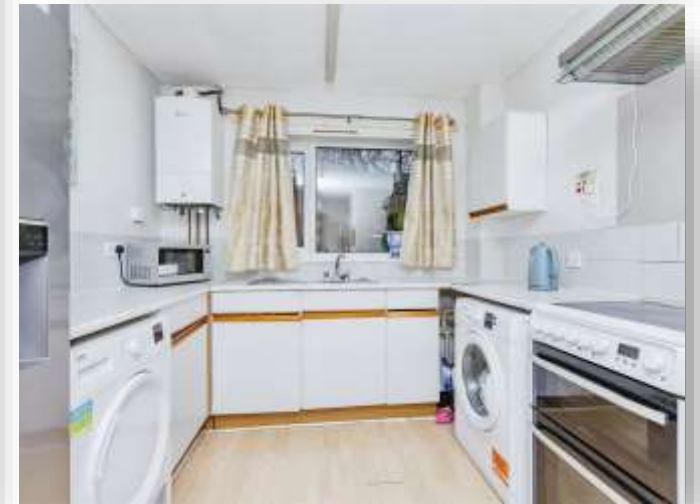
Glaisdale Close, Leicester LE4 0RP