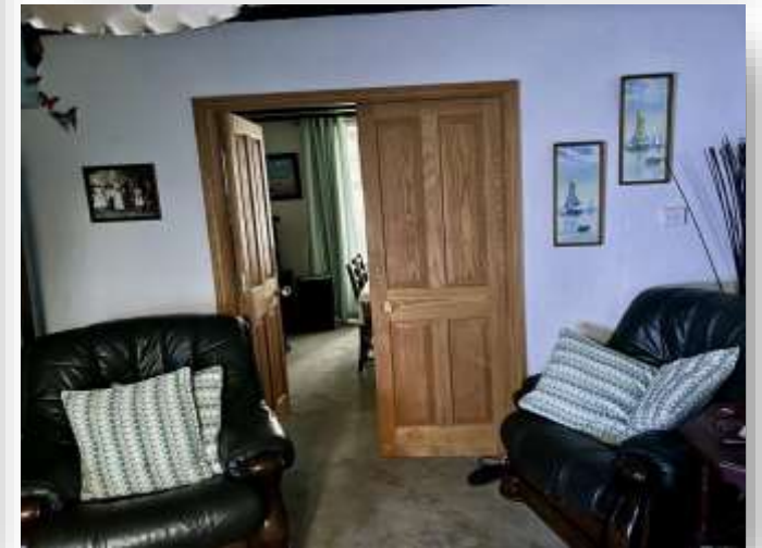
Peverel Road, Leicester LE3 1EW