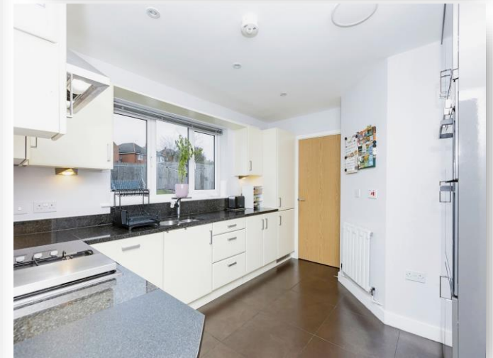
Monterey Court, Leicester LE5 1AU