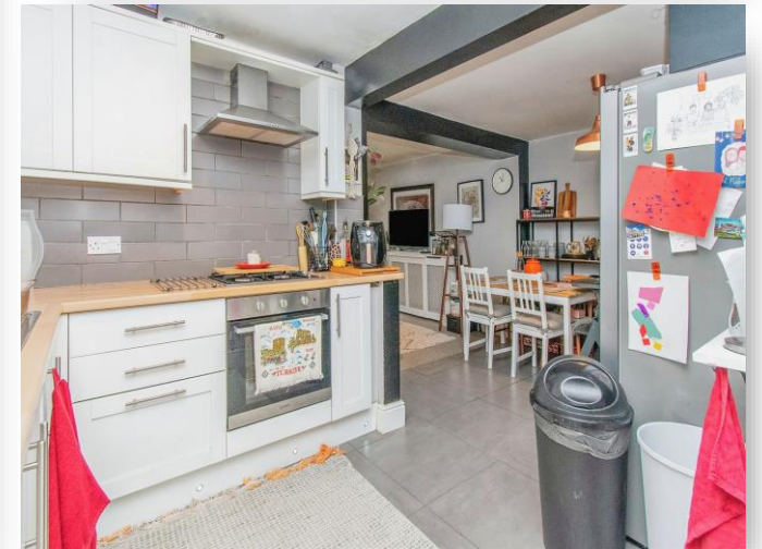
New Romney Crescent, Leicester LE5 1NL