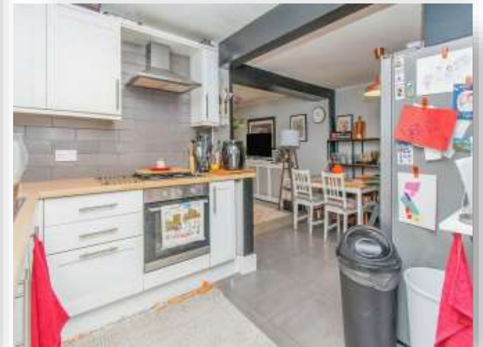
New Romney Crescent, Leicester LE5 1NL