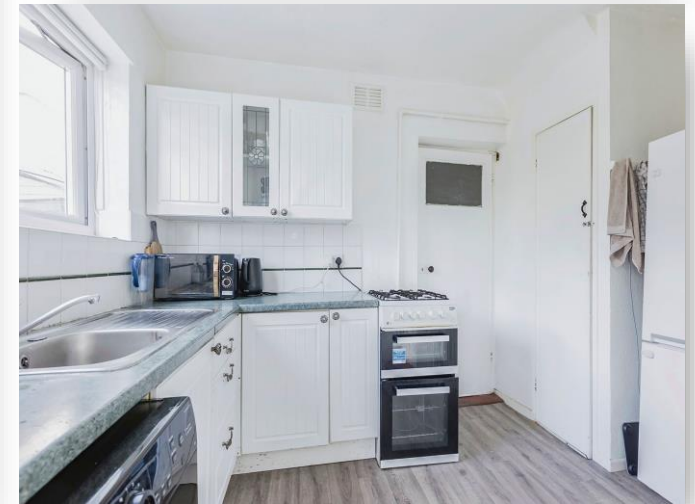
Tolcarne Road, LEICESTER LE5 1JB