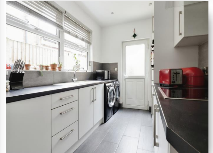
Barclay Street, Leicester LE3 0JE