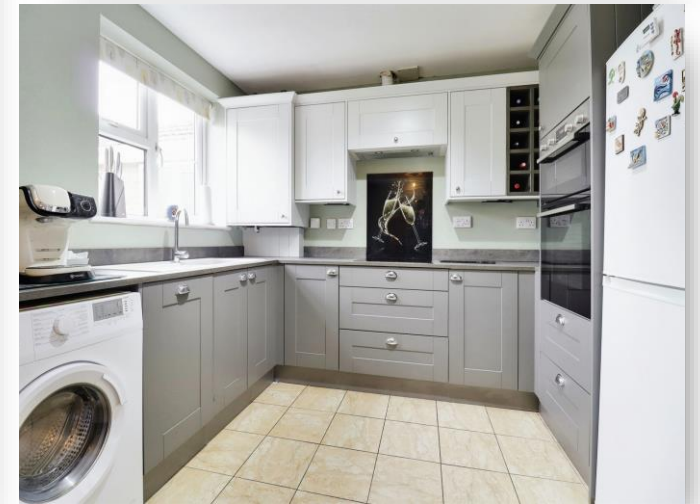
Appleby Road, Thurmaston Leicester LE4 8BQ