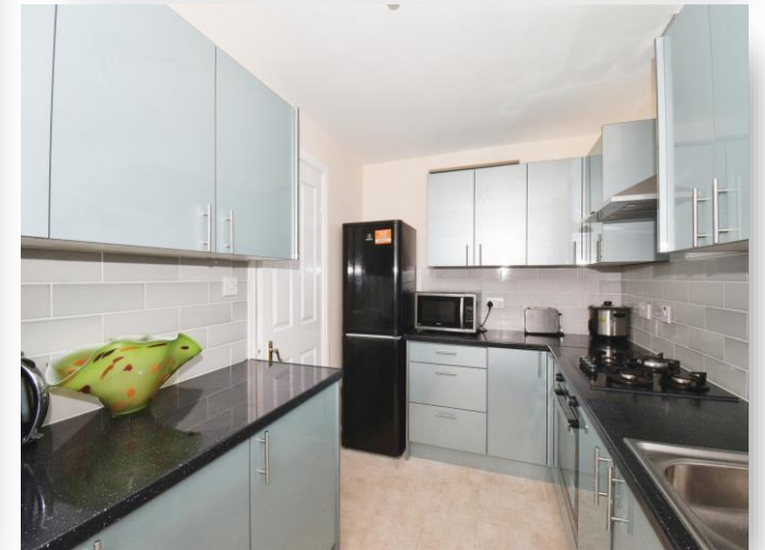
Bewicke Road, Leicester LE3 1BA