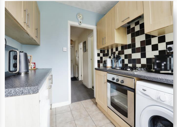
Overpark Avenue, LEICESTER LE3 1NN