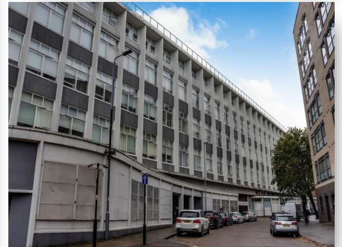
The Exchange Lee Street, Leicester LE1 3AH