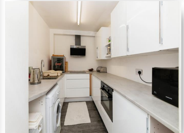
Knighton Road, Leicester LE2 3TS