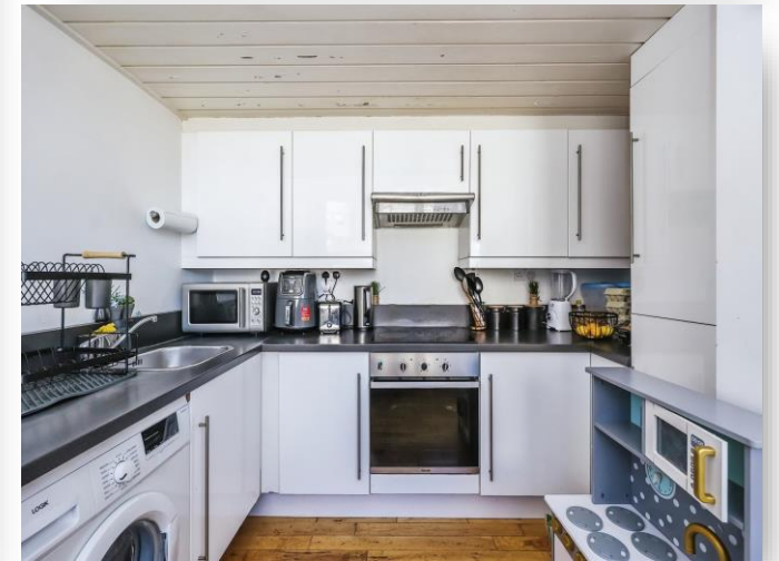
The Exchange Lee Street, Leicester LE1 3AH