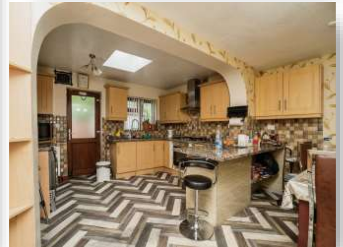
Bracken Close, Leicester LE5 4JY