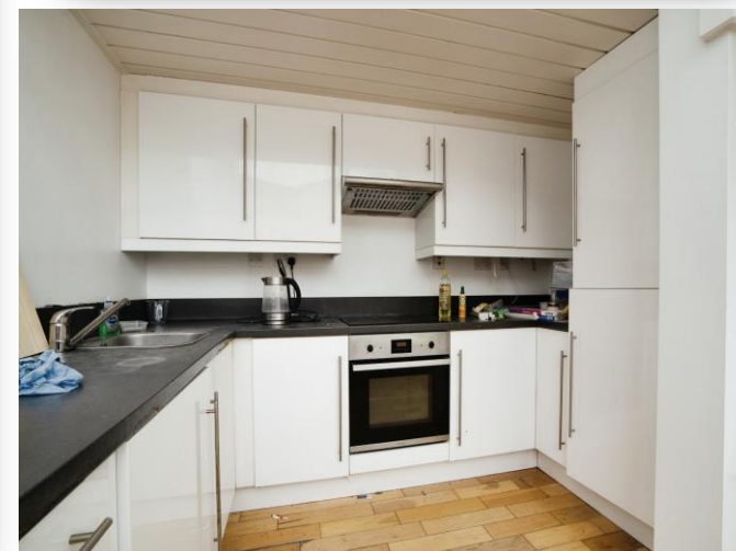
The Exchange Lee Street, Leicester LE1 3AJ