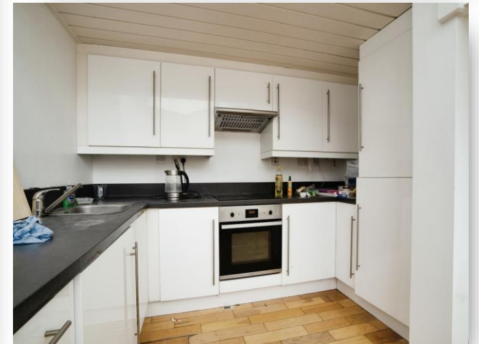
The Exchange Lee Street, Leicester LE1 3AJ