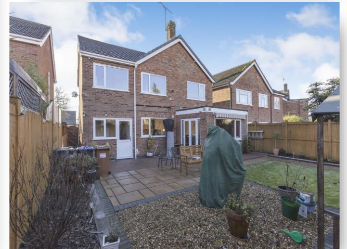
Barbara Avenue, Newbold Verdon LEICESTER LE9 9NS