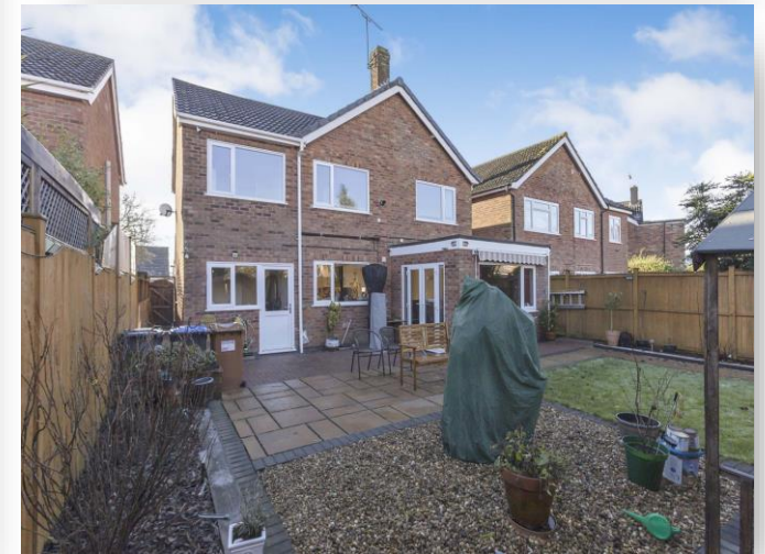
Barbara Avenue, Newbold Verdon LEICESTER LE9 9NS