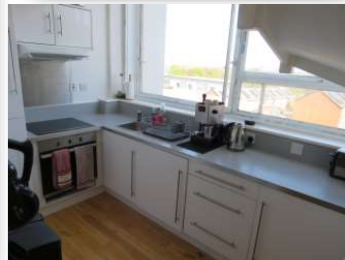
The Exchange Lee Street, Leicester LE1 3AH