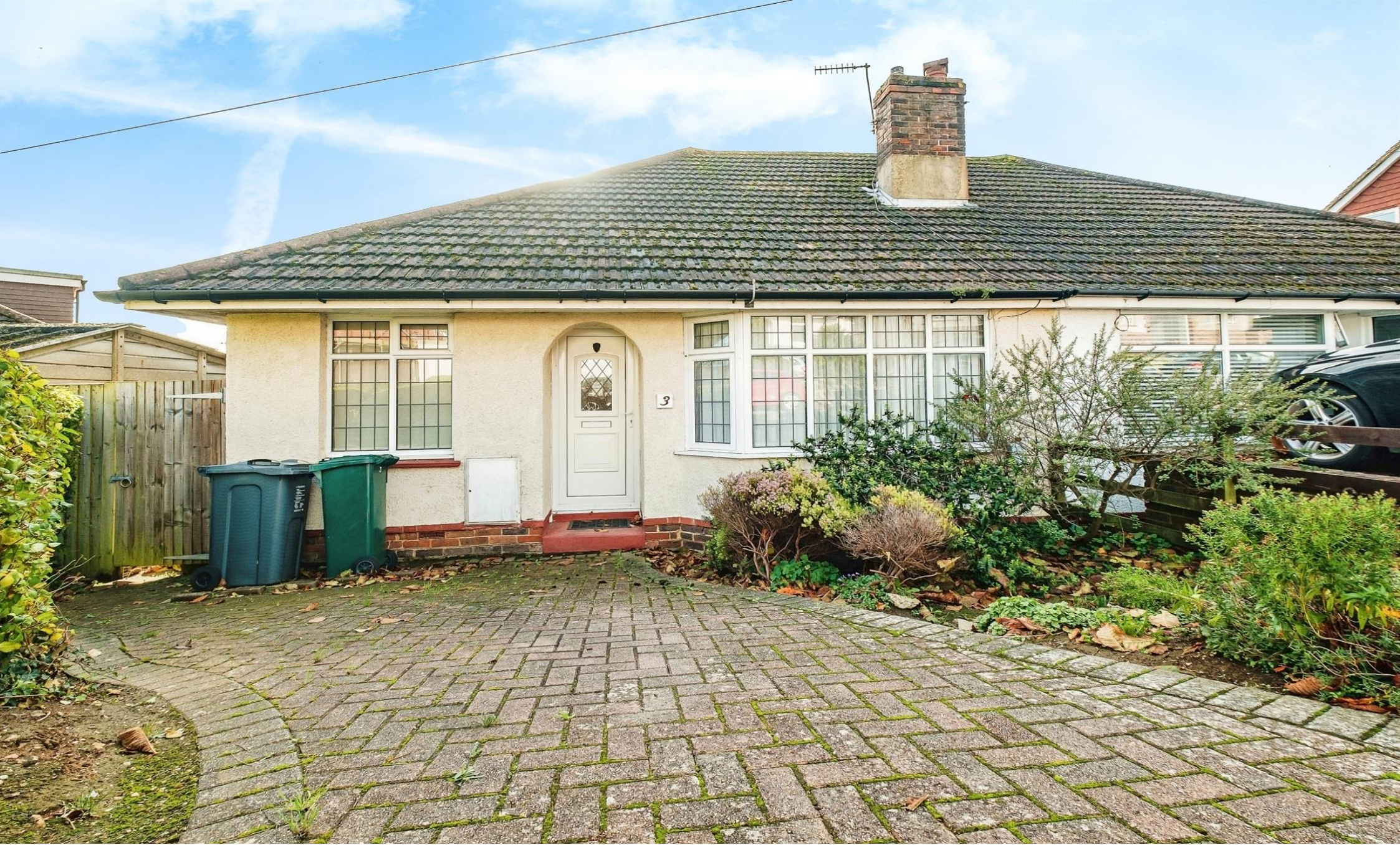
Gleton Avenue, Hove BN3 8LN