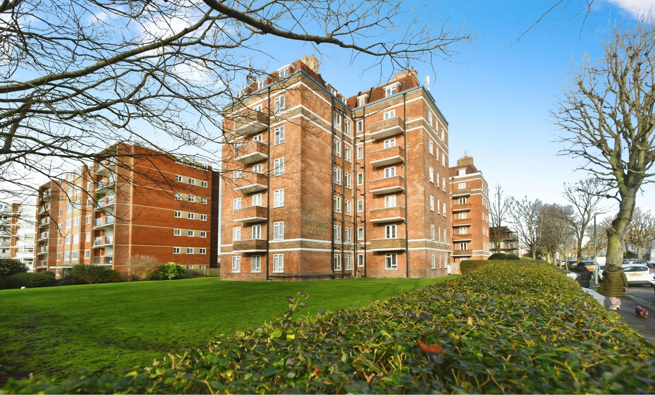
Rutland Court New Church Road, Hove BN3 4AE