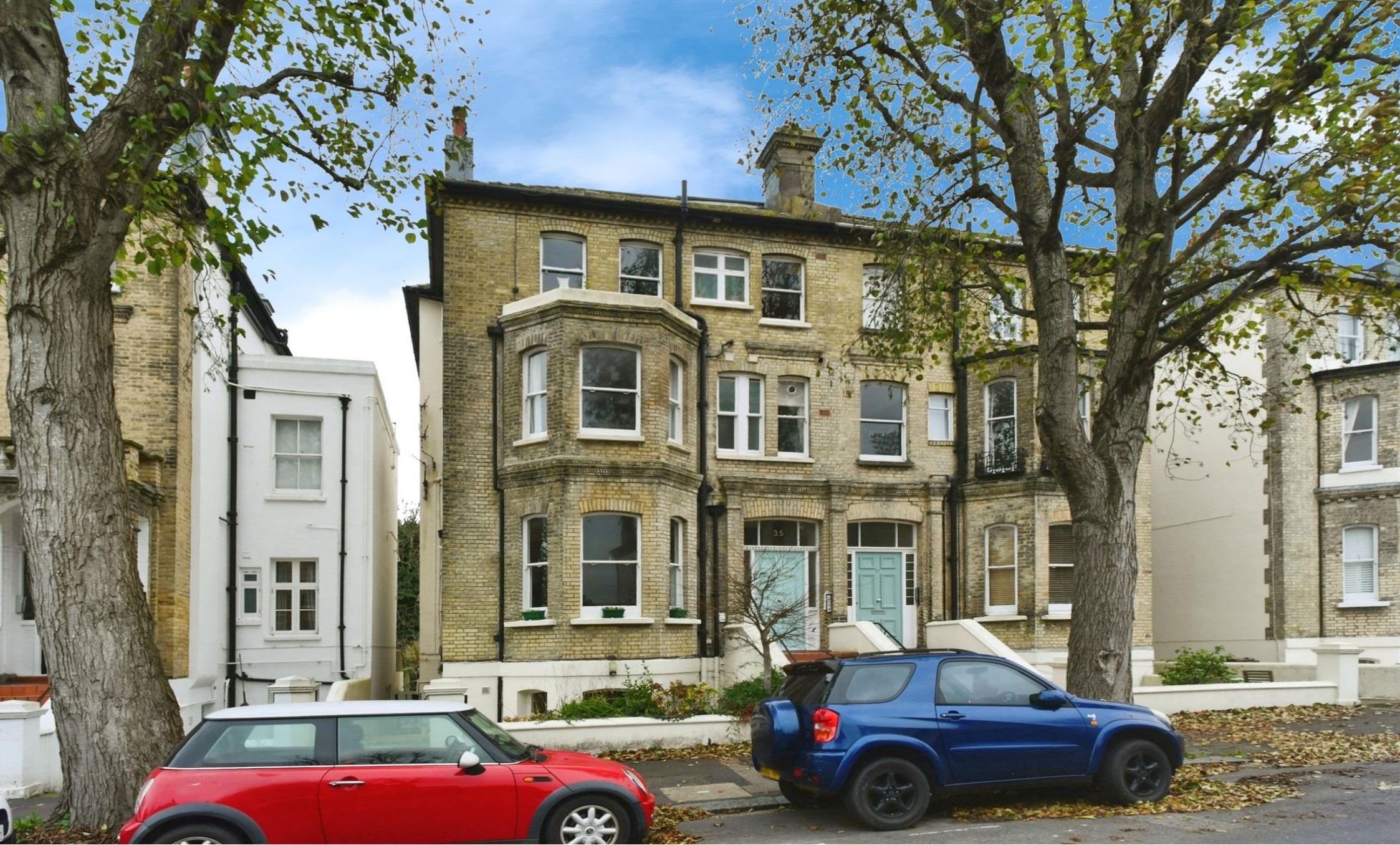
Wilbury Road, Hove BN3 3PB