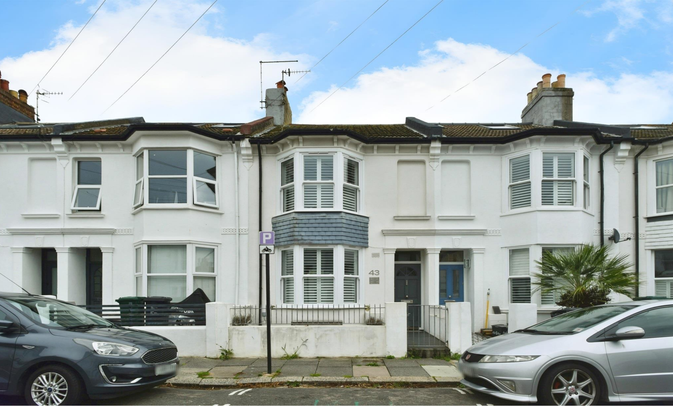
Montgomery Street, Hove BN3 5BE