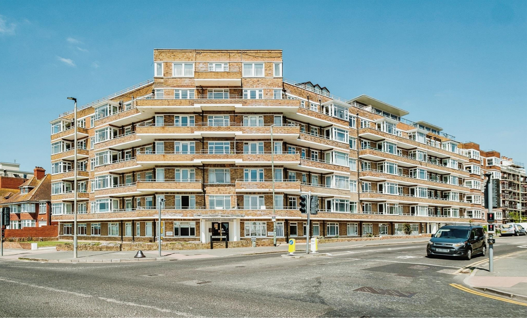
Viceroy Lodge Kingsway, Hove BN3 4RA