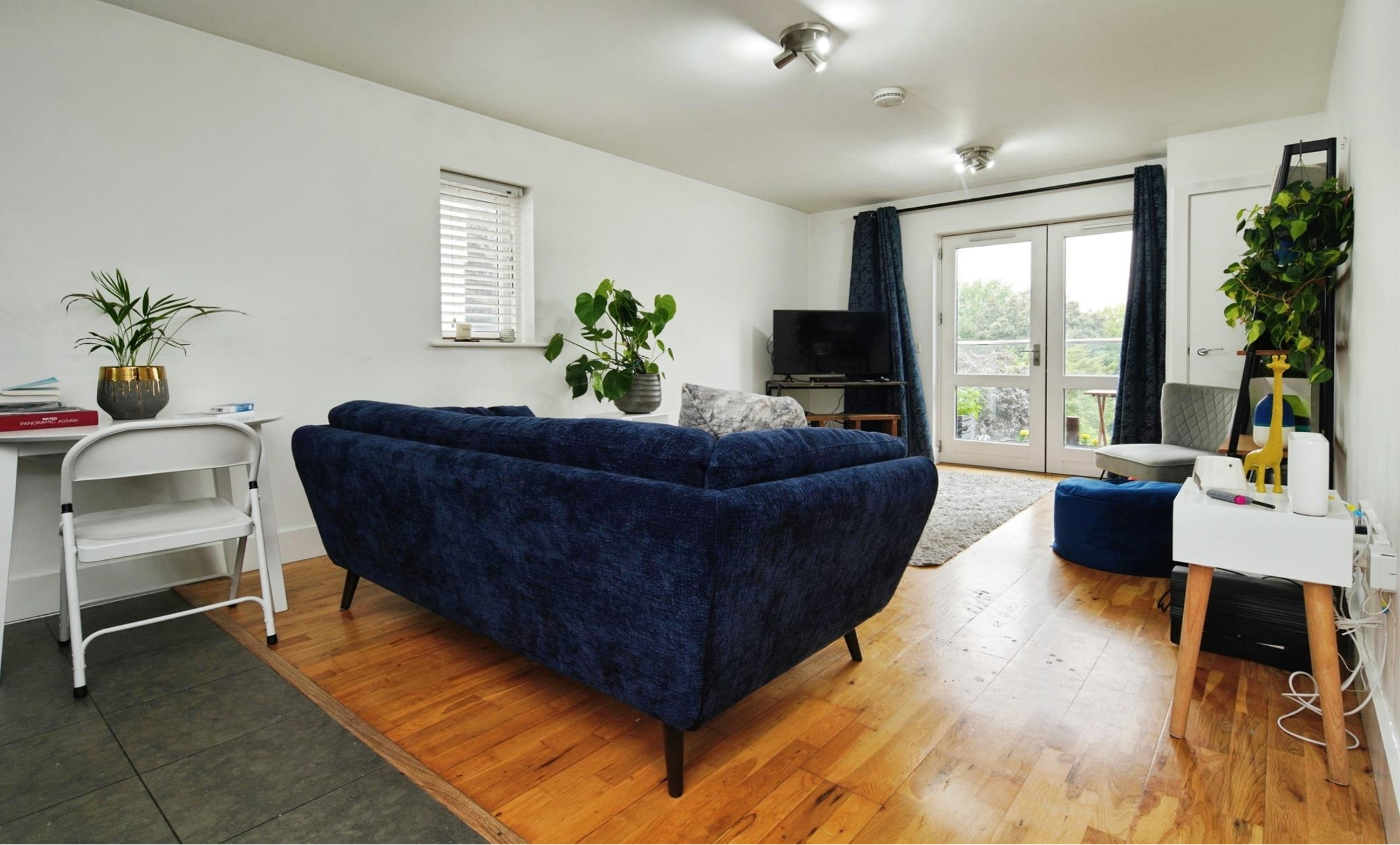
The Upper Drive, Hove BN3 6GR