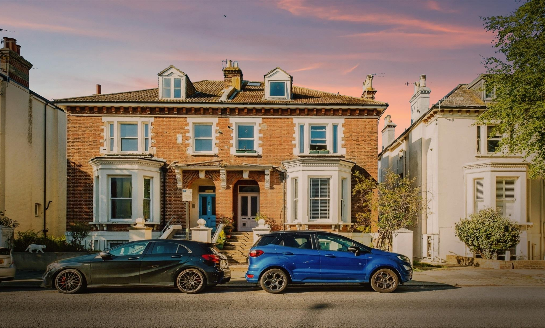
Maisonette Clarendon Villas, Hove BN3 3RE