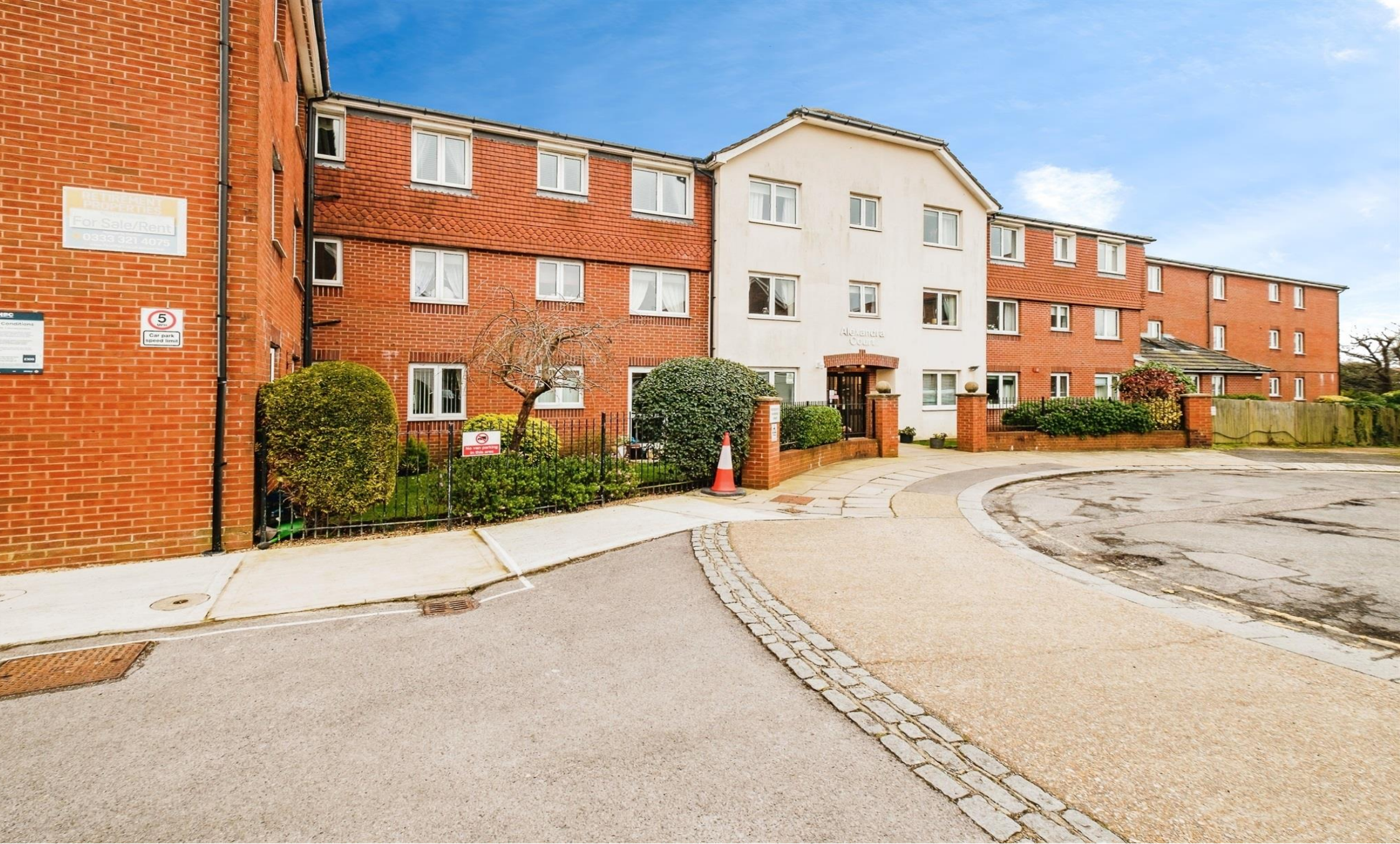
Alexandra Court St Peters Close, Hove BN3 7RF