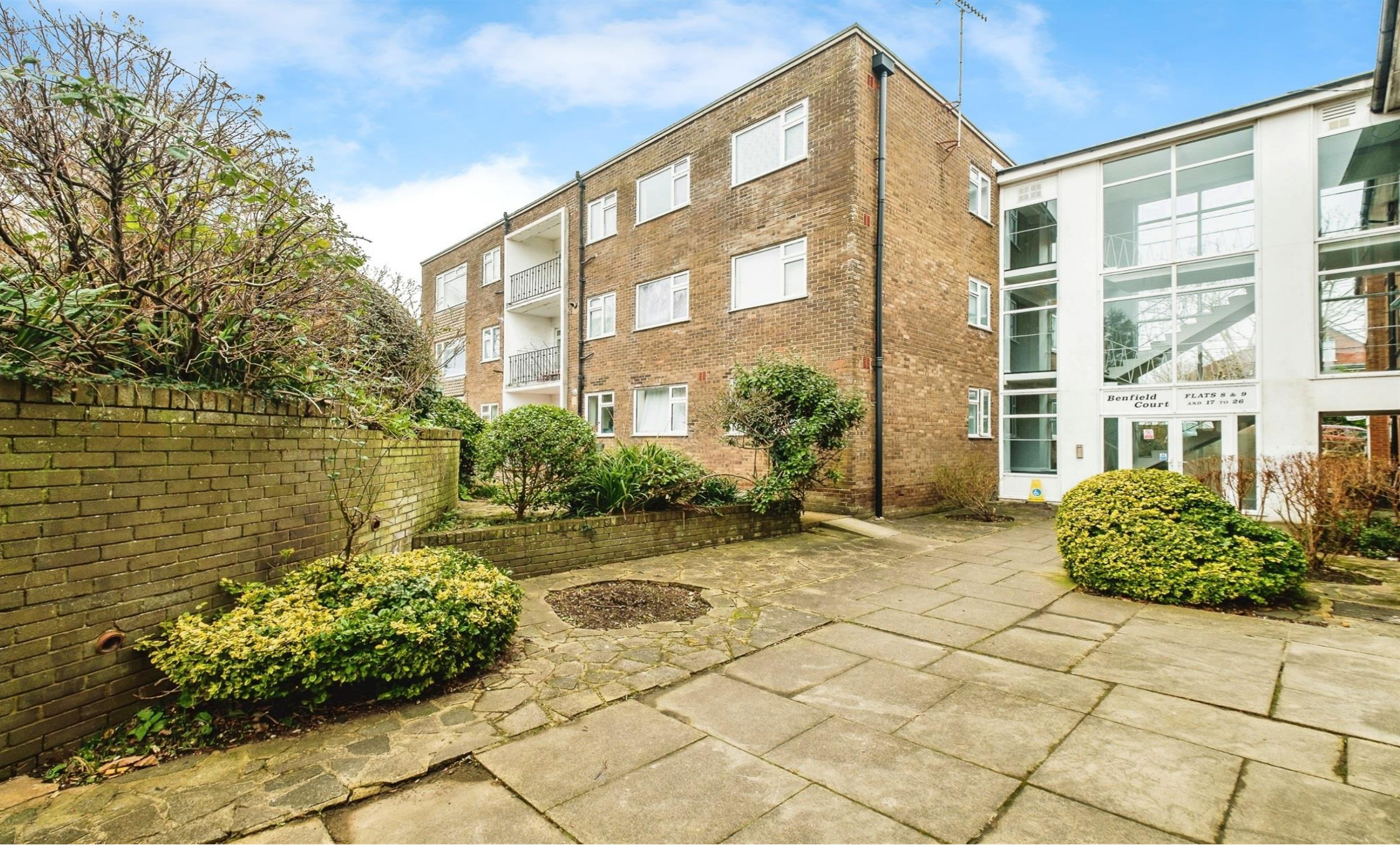
Benfield Court Old Shoreham Road, Portslade Brighton BN41 1XT