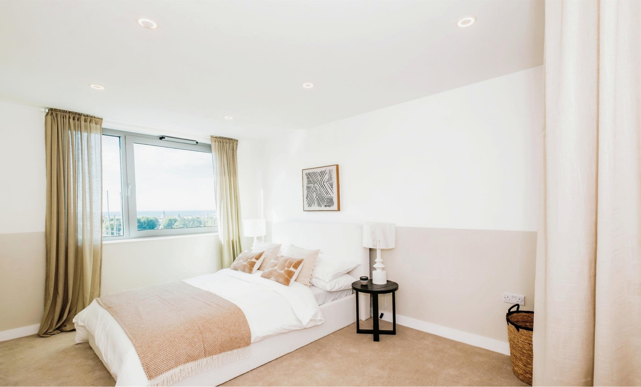
Palmer House Davigdor Road, Hove BN3 1RE