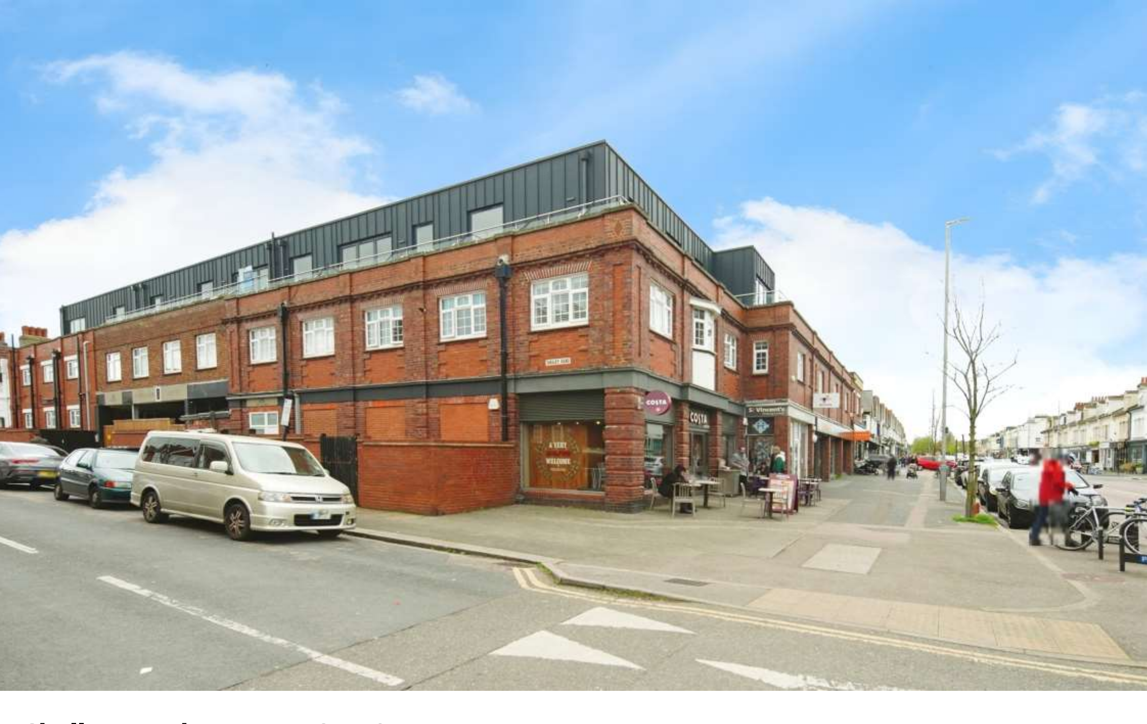
Shelley Road, Hove BN3 5FQ