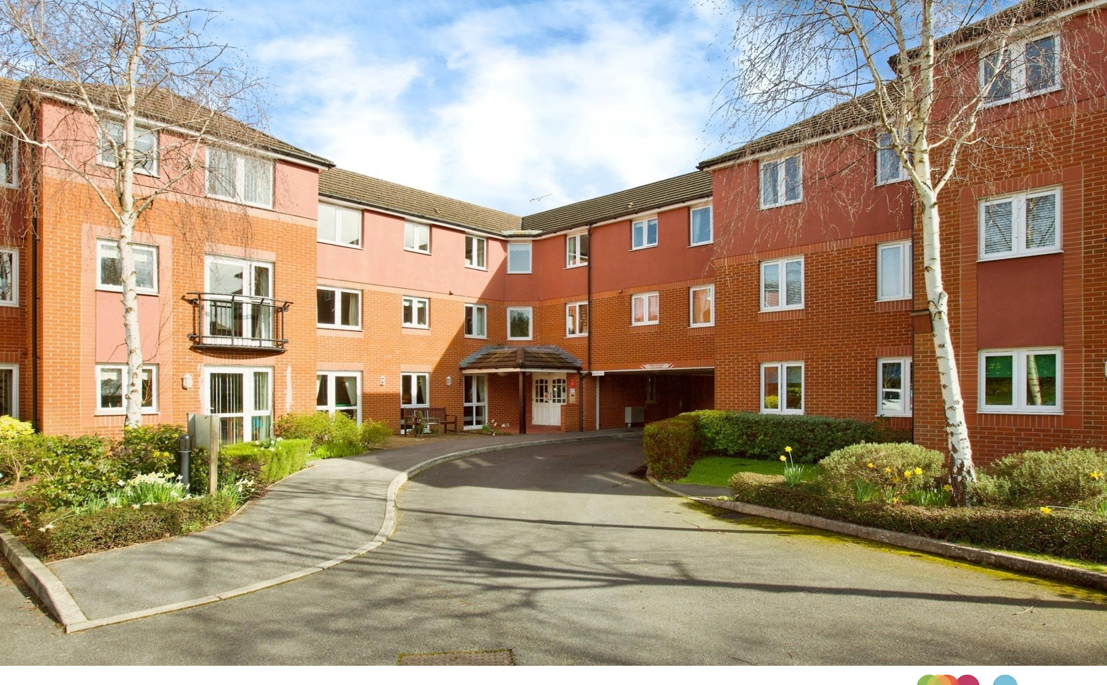
Berryfield Court, Bursledon Road, Hedge End, Southampton SO30 0BN