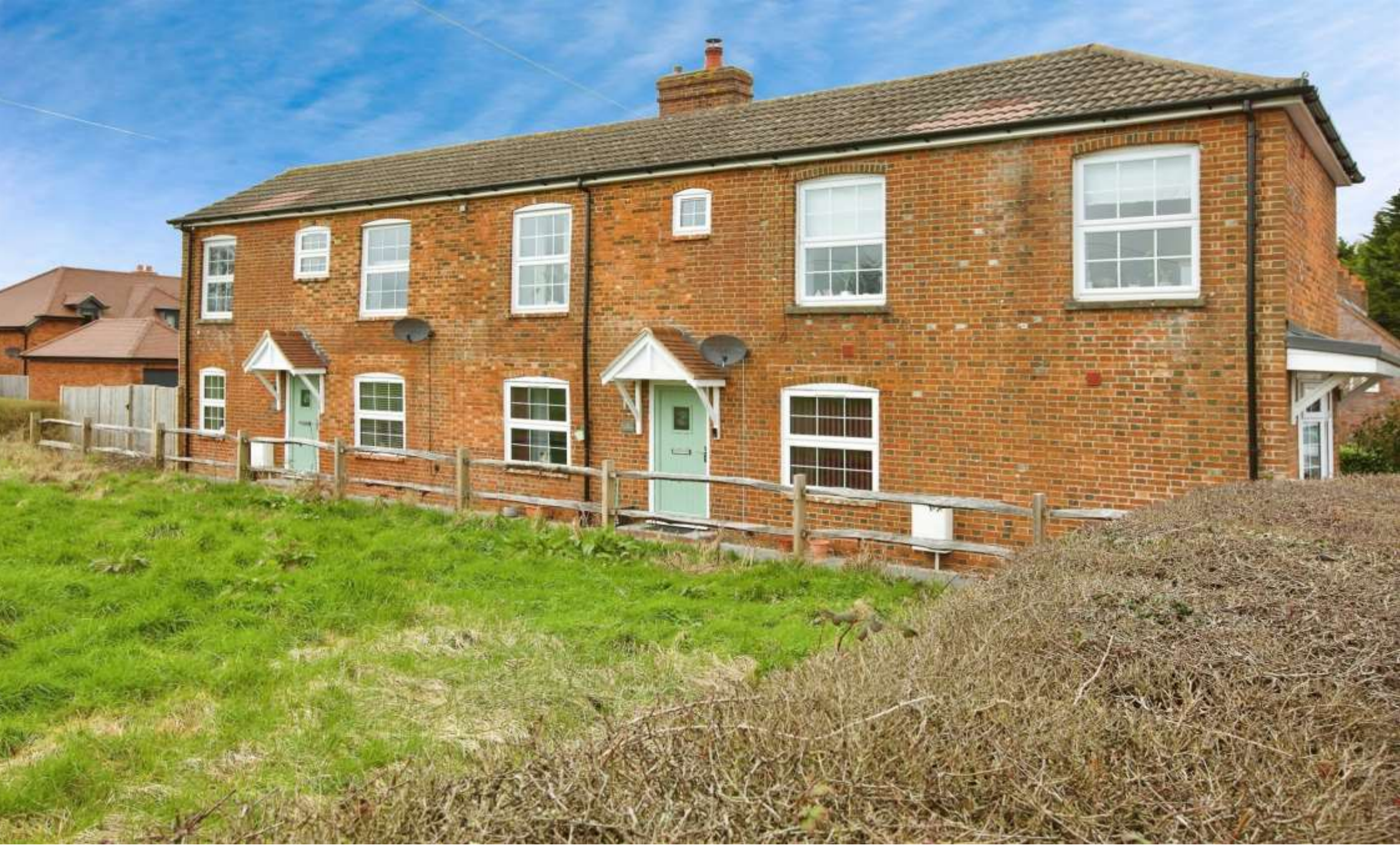
Rosehill Villa Winchester Road, Waltham Chase, Southampton, SO32 2LX