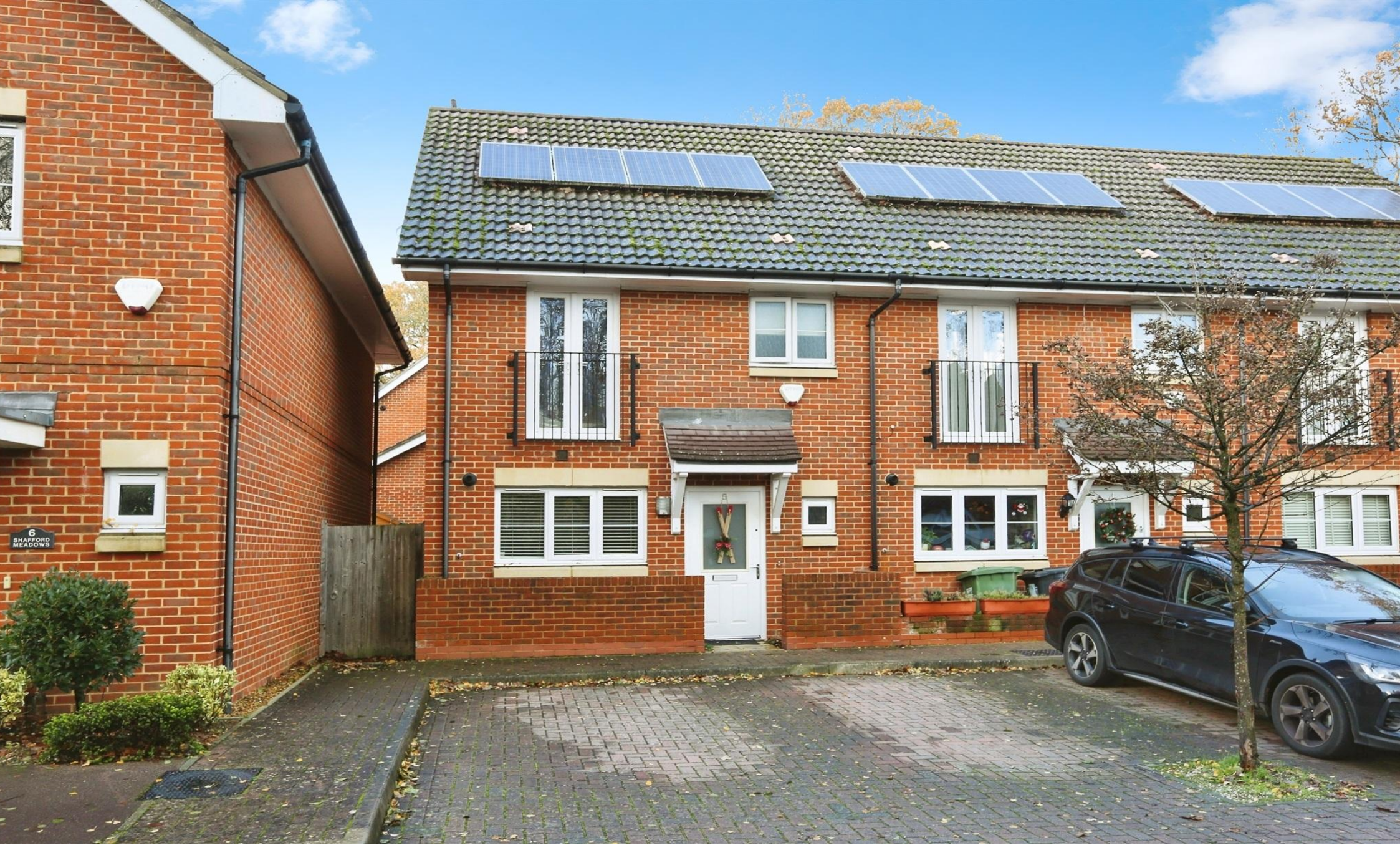
Shafford Meadows, Hedge End, Southampton, SO30 4SU