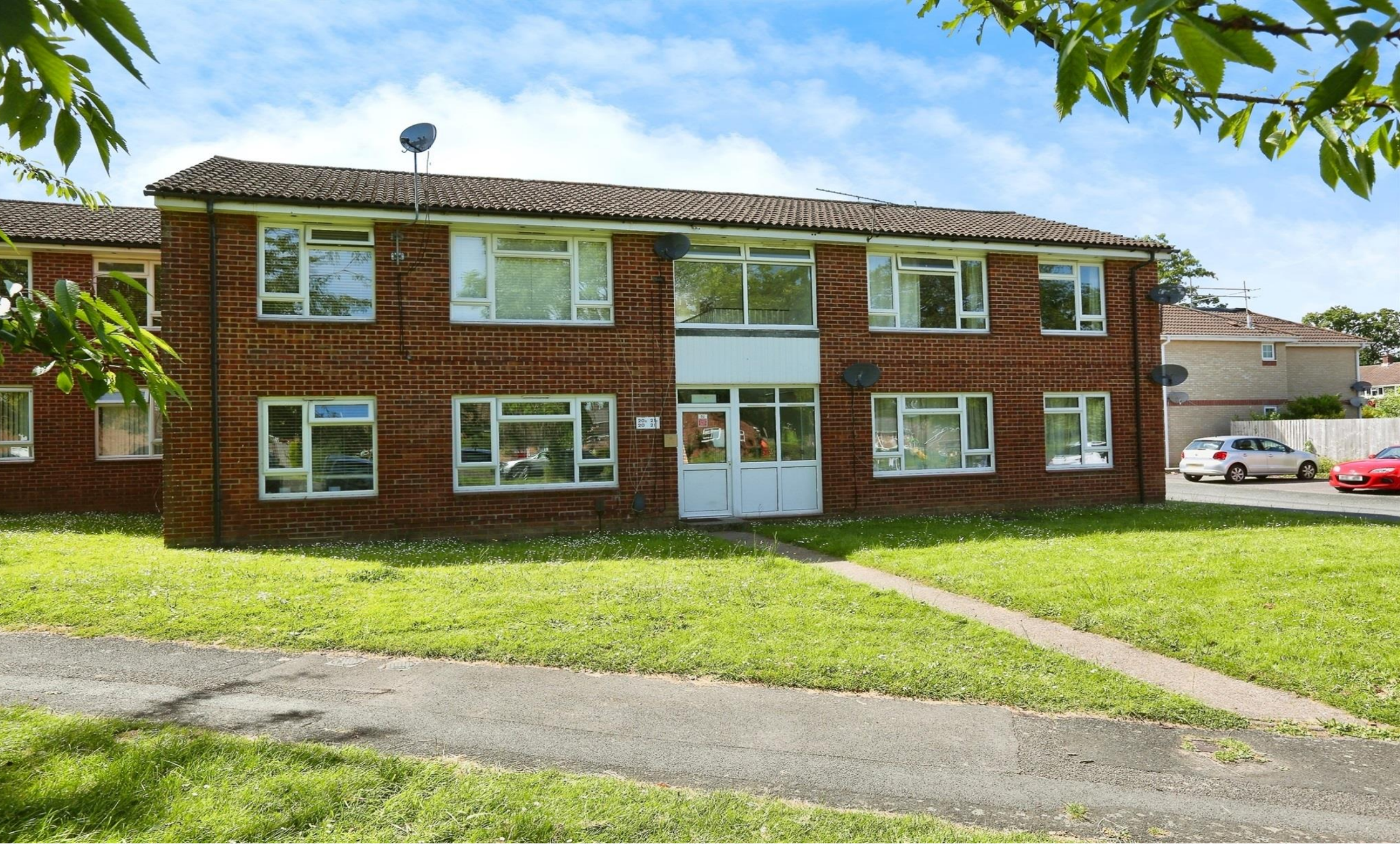
Simmons Close, Hedge End, Southampton, SO30 4NT