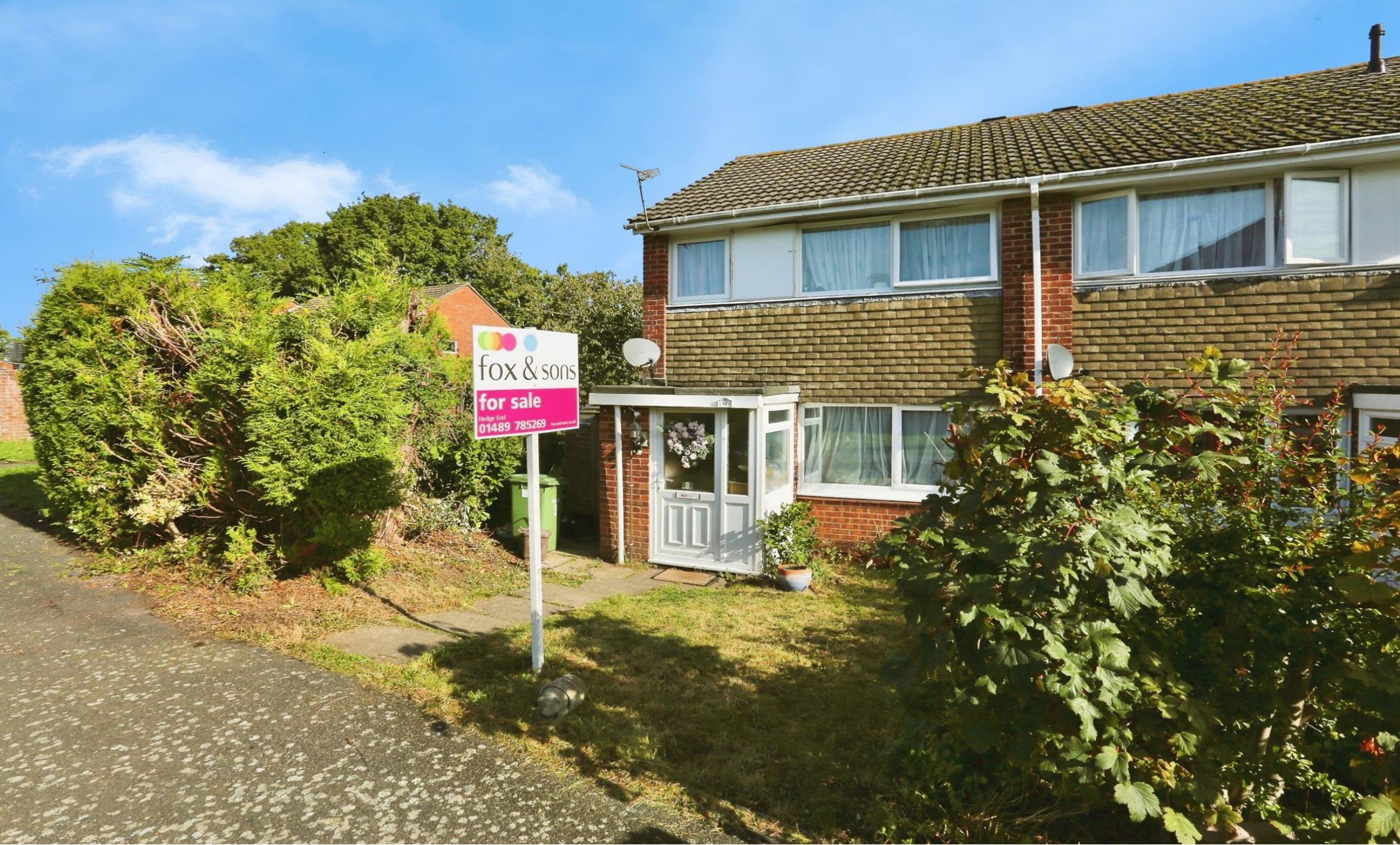
Paxton Close, Hedge End Southampton, SO30 0PB