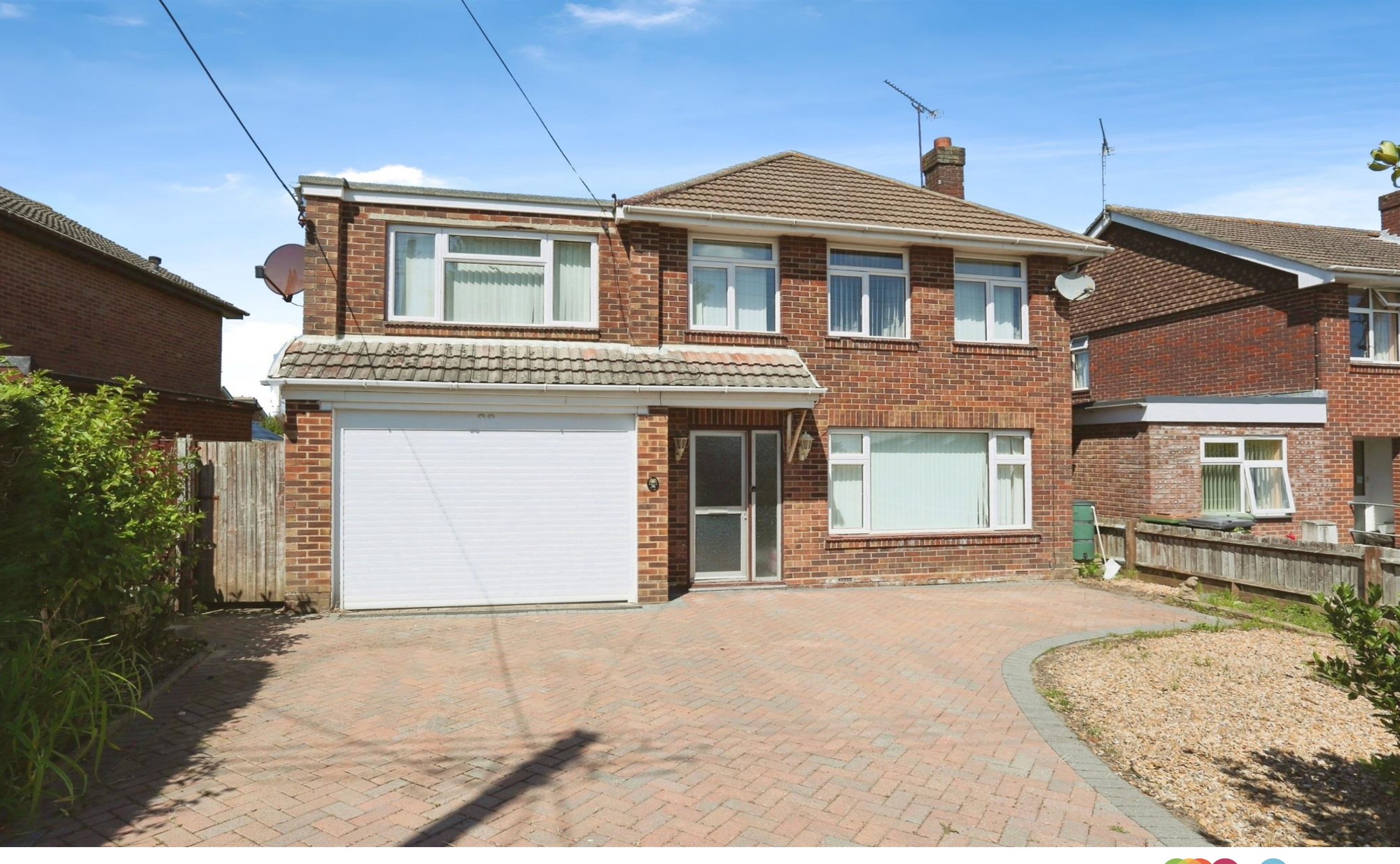
Lower St. Helens Road, Hedge End, Southampton, SO30 0LU